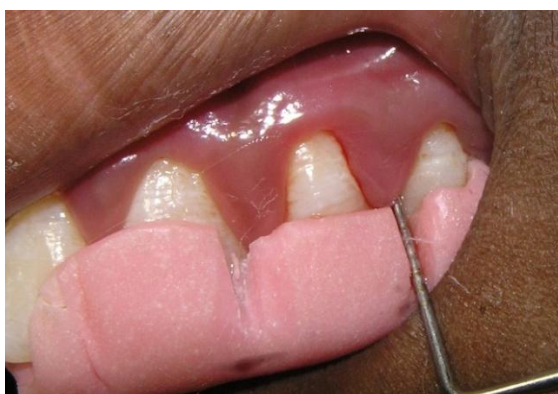
Fig. 1: Pocket measurement with a standardised acrylic stent

experimental local drug delivery system containing tetracycline hydrochloride, serratiopeptidase and bactase can be effectively used as an adjunct to scaling and root planing and is more effective than scaling and root planing alone in the treatment of periodontal pockets. To elucidate the use of this local drug delivery system in future, a long term study carried out on a large sample of subjects is required. Also, in addition to darkfield analysis, culture methods for microbiological analysis of individual periodonto pathogens should be carried out. An attempt is required to find out the efficacy of the experimental material in comparison to the marketed local drug delivery system.