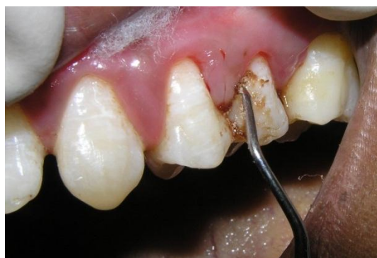
Fig. 3: Insertion and stabilisation of drug inside pocket