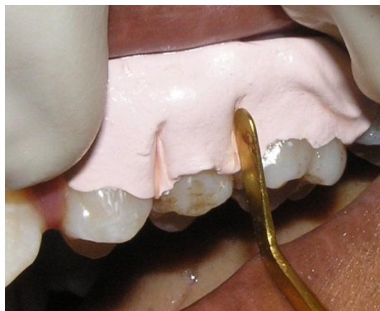
Fig. 4: Application of Coe-pack