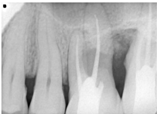
Fig. 7: One year post operative radiograph