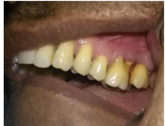
Fig. 1: Pre- operative photograph

For molars with furcation involvement root-resection therapy is still a valid treatment option. The successful root resection requires careful multidisciplinary approach including endodontic treatment, periodontal treatment and prosthetic rehabilitation. Although long term prognosis and efficacy of the procedure is controversial, 1989 world workshop stated that “root resection is a procedure which still remains as a part of periodontal armamentarium to treat very specific cases which cannot be solved by any other therapeutic approach and where tooth in question has a high strategic value”.