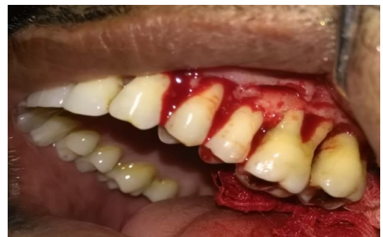
Fig. 3: After flap reflection