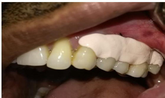
Fig. 6: COE pack given