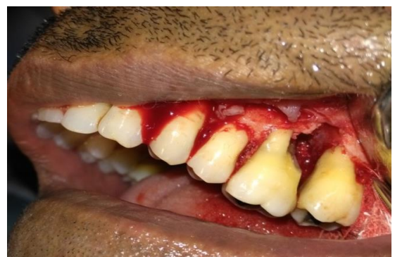
Fig. 4: Distobuccal root resection