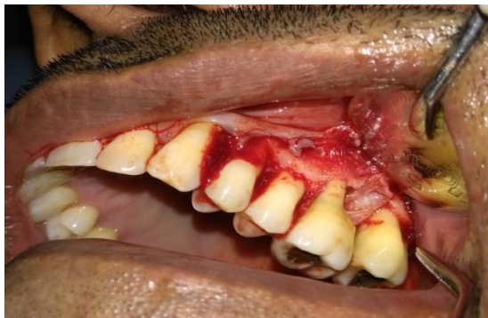
Fig. 5: Bone graft and PRF membrane placed