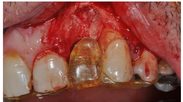
Fig. 3: A surgical guide was positioned in order to provide adequate accuracy for implant placement