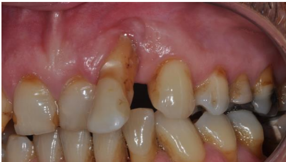
Fig. 1: Baseline. Buccal aspect of #22 with 6 mm of CAL. Small inclination compromising the aesthetics of the smile. Minimum amount of attached gingiva in region #22

A healthy 56-year-old Caucasian man who is an ex-smoker presented at Positivo University's Dental Clinic. His major complaint was the aesthetics of his upper maxillary left lateral incisor #22 (Fig. 1). In the clinical exam, the presence of deep probing depth, bleeding on probing, grade II tooth mobility, and a loss of clinical attachment (CAL) ( \geq 6 mm in the buccal side) were noted. A computed tomography scan made it possible to observe severe bone loss on the buccal surface of tooth 12. The proposed treatment was extraction, immediate installation of an implant, and aesthetics with autogenous bone grafting and soft tissue manipulation. Once there was not enough gingiva to cover the implant, it was necessary to slide a lateral flap.