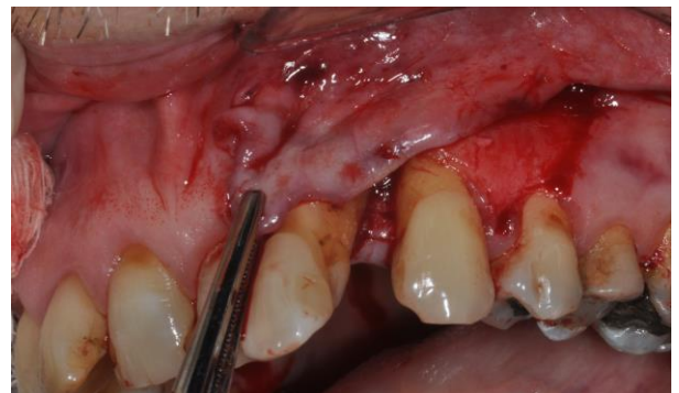
Fig. 2: Because of the lack of keratinised gingival tissue at tooth 22, a lateral positioned (split) flap (LPF) was realised from teeth 23 and 24. This technique has guaranteed optimal nutrition

The flap was then positioned laterally to cover the future implant and guarantee gingival augmentation (Fig. 2). To provide adequate accuracy for implant placement, a surgical guide was used in the surgery (Fig. 3). The implant site was prepared with standard drills by using the bony walls as a guide, under copious saline irrigation. Moreover, the implant was placed at the palatal level of the bone crest (i.e., 2 mm apical of the bone height at the mesial and distal level). Good primary stability was obtained, considering the lack of the buccal wall. A Frictional I implant with a standard platform (3,75mm x 11mm) (Koop Curitiba/PR, Brazil) was installed according to the manufacturer's instructions (Fig. 4). A torque of approximately 35 N was achieved, which was measured by a precisely calibrated ratchet. After the insertion of the implant, the buccal bone defect was filled with an autogenous bone graft from the tuberosity of the maxilla (Fig. 5A). Finally, in order to cover the buccal surface of the implant with gingiva and increase the volume of the buccal tissue, CTG was associated with LPF. The LPF was able to cover the bone and soft tissue graft completely with simple interrupted sutures (4-0 Vicryl, Ethicon), taking care to avoid excessive tension (Fig. 5C). Then a temporary crown was installed in the infra occlusion.