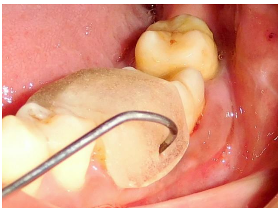
Fig. 1: Pre-operative horizontal furcation depth

Pre-Operative Measurements: Probing pocket depth, PD = 4mm, Relative attachment level, RAL= 10 mm, Horizontal furcation defect, HFD= 4mm was recorded at baseline. A stent was fabricated with self-cured acrylic resin for insertion of the Naber's probe in the furcation defect.(Fig. 1) Clinical parameters were recorded at baseline, 3 months and 6 months interval. Radiographs of the site were recorded preoperatively(Fig. 2) and postoperatively at 3 and 6 months.