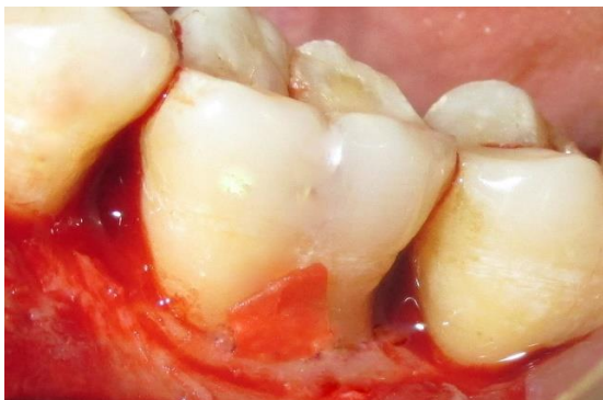
Fig. 5: Furcation defect with GTR membrane in place