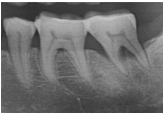
Fig. 2: Pre-operative RVG

Surgical Procedure: After phase-I therapy, surgical procedure was performed under proper aseptic precautions to keep the surgical site clean. After injecting local anesthesia (2% Xylocaine® Dental with 1:80,000 adrenaline, Novocol Pharmaceutical of Canada, Cambridge, ON, Canada), sulcular incisions were placed, a full thickness flap was elevated at the furcation site, extending at least one tooth mesial and distal to the affected tooth, and extended beyond mucogingival junction.(Fig. 3) The furcation area was thoroughly debrided and cleaned using furcation