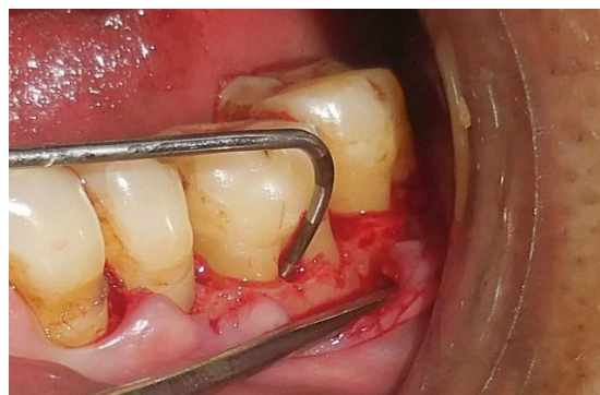
Fig. 3: Furcation defect upon flap reflection

curette, hand and ultrasonic scalers. After this, the defect area was condensed with the bone graft particles ( Ostin™ , Basic Healthcare Pvt Ltd, Himachal Pradesh, India) mixed with saline and covered by bioabsorbable GTR membrane ( Periocol® , Eucare Pharmaceuticals Pvt. Ltd., Chennai, India)(Fig. 4 & 5). The membrane being hydrophilic in nature adapted well over the defect and no suturing was required. Flaps were then repositioned and sutured back (Mersilk®, Ethicon, Sommerville, NJ, USA) (Fig. 6). Periodontal dressing was applied over the site (Coe Pak®, GC America, Alsip, IL, USA). Postoperative regimen of amoxicillin 500 mg tds for 5 days, ibuprofen 400 mg tds for 5 days and postoperative instructions were given. Patient was recalled for periodontal dressing and suture removal after 1 week. Post-operative periodontal examination revealed reduction in vertical probing depth (VPD = 3mm) and horizontal furcation depth (HFD = 2mm) (Fig. 7) and radiographs revealed increased bone density (Fig. 8), thereby indicating successful resolution of inflammation and periodontal regeneration in the furcation defect area.