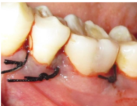
Fig. 6: Flap sutured at desired position