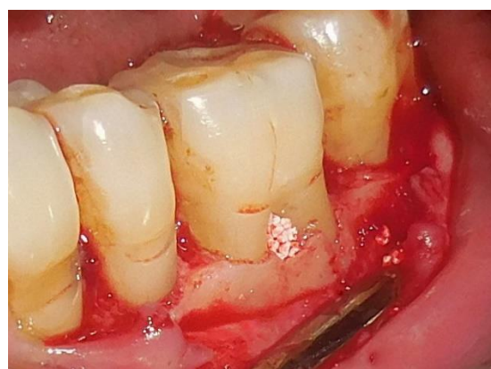
Fig. 4: Furcation defect with alloplastic bone graft