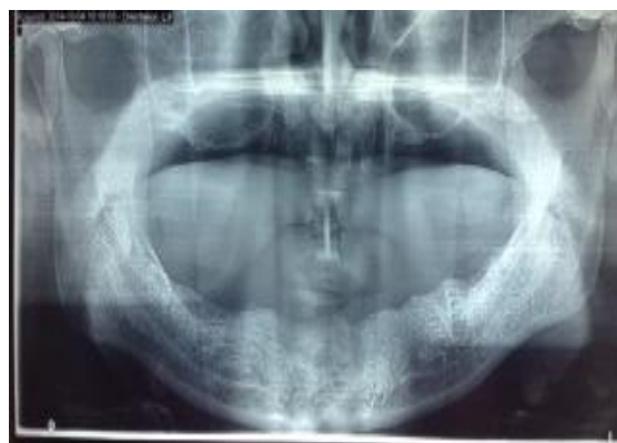
Fig. 1: Pre-operative Orthopantomogram

A 72 year old patient presented to the Department with a chief complaint of an unstable denture that posed a problem while eating and talking. Dental examination revealed that the mandibular and maxillary alveolar ridges were resorbed, the patient's previous dentures were worn out that led to a reduction in vertical facial height. The patient was the given the option of making a new conventional complete dentures, implant supported fixed prosthesis and implant over-denture. The patient opted for implant supported fixed prosthesis.