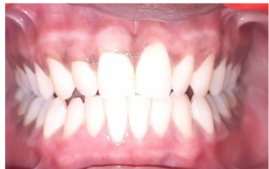
Figure 6: Post-operative view after 1 month