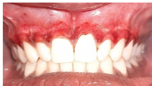
Figure 2: Removal of pigmented layer with scalpel technique