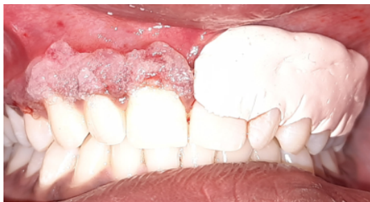
Figure 3: Placement of COE-PAK & Blue M gel on respective sites