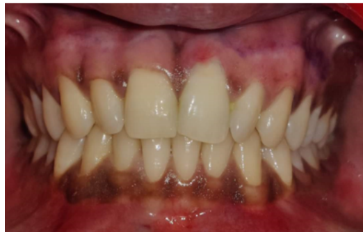
Figure 4: Post-operative after 1 week