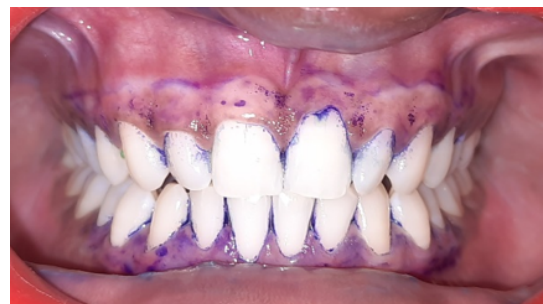
Figure 7: Toluidine blue staining to evaluate Re-epithelization after 1 month