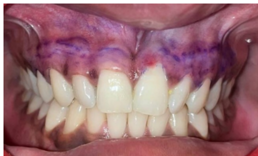
Figure 5: Toluidine blue staining to evaluate Re-epithelization after 1 week

of the healing process. Wound healing is a complex and dynamic process requiring an appropriate environment to promote healing. Wound healing is a complicated process comprised of four constant, intersecting, and programmed stages, the events of which must occur in a specific order. Haemostasis, inflammation, proliferation, and maturation or remodelling are the main four stages of wound healing. Each of these stages is important in providing the healing process to progress. 14 Evidence indicates that oral wounds can be accompanied by postoperative pain and discomfort, the magnitude of which is related to the surgical approach used, the size of the wound, and the time it takes for the