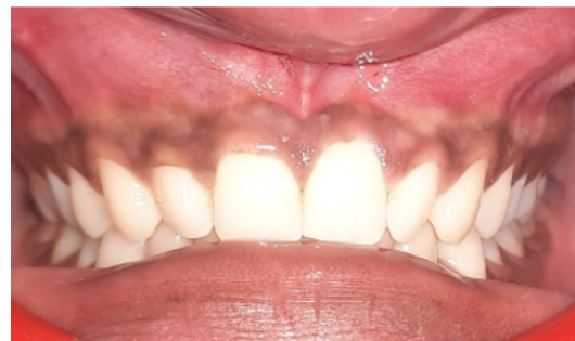
Figure 1: Pre-operative view