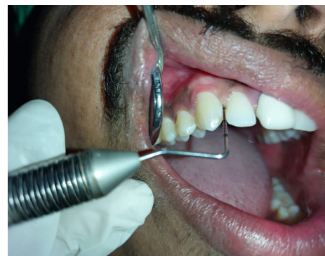
Fig. 5: Measuring probing pocket depth