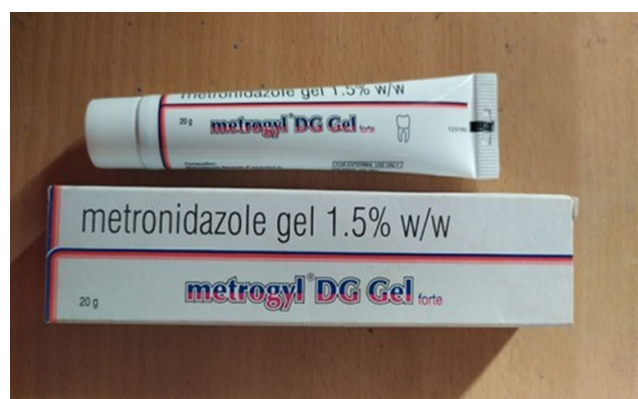
Fig. 2: Metronidazole gel