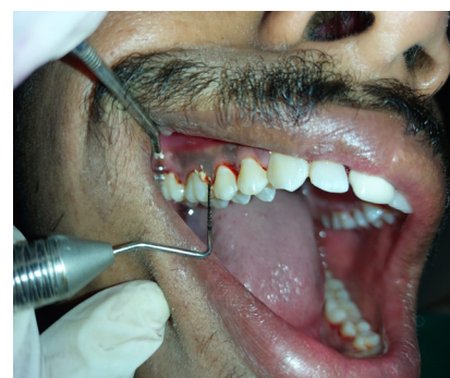
Fig. 6: Placement of tetracycline fibres