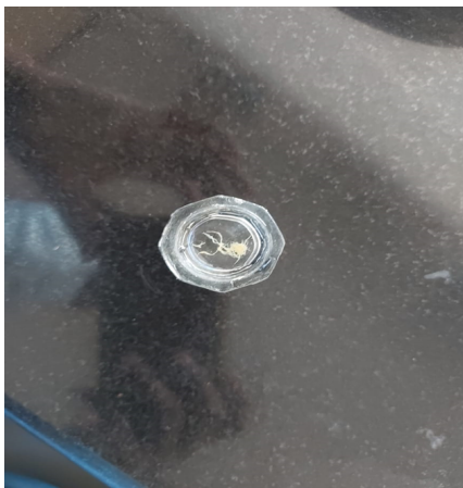
Fig. 1: Tetracycline fibres (Periodontal plus AB)

A total of 20 patients with chronic periodontitis after a recall period of 1 week were included, where 10 patients received metrogyl sub gingivally and the other 10 patients received tetracycline fibres. Statistical analysis was done using Statistical Package for the Social Sciences (SPSS) software version 25.0. and independent t test was performed for inter-group comparisons.