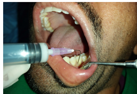
Fig. 4: Placement of Metrogyl gel