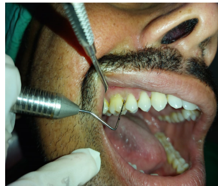
Fig. 3: Measuring probing pocket depth