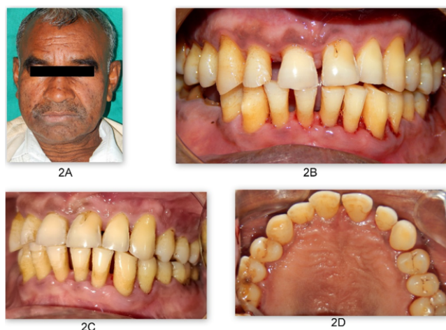
Fig. 2: A: Facial View: swelling resolved on below the left eye; B: Frontal view periodontal abscess wrt 21,22,23 and gingivitis were resolved; C: lateral view periodontal abscess resolved wrt 21,22,23; D: Palatal View Palatal swelling resolved.