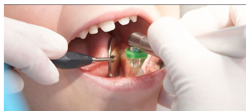
Fig. 3: Healozone unit in use 11