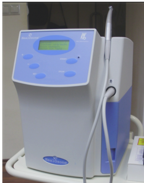
Fig. 2: Fully assembled Healozone Unit 11

Ambient air is filtered and dried before it is passed over a ceramic plate. Then high voltage is applied, producing ozone. Ozone therapy with a high volume suction is applied for 6, 12 or 24 seconds based on the treatment. Usually, this is about 21s for surgical disinfections and 18s for periodontal disinfection. 13