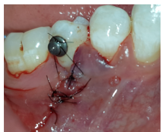
Fig. 11: Flap sutured