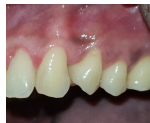
Fig. 1: Pre-operative view

28 year old male patient came with a chief complaint of sensitivity in upper left back tooth from past 2 months. No relevant medical and dental history present. On intraoral examination gingival recession was seen in relation to 24 with probing depth of 2 mm and CAL of 4 mm.