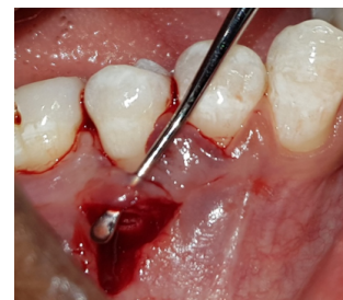
Fig. 9: Tunneling done