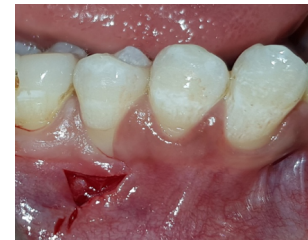
Fig. 8: Incision placed