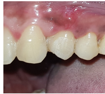
Fig. 6: 3 months post-operative view