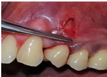
Fig. 4: A-PRF membrane placed