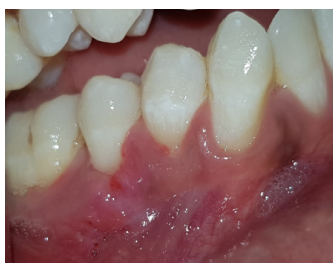
Fig. 12: 3 months post-operative view