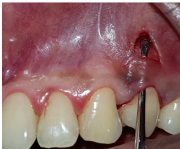
Fig. 3: Tunneling done