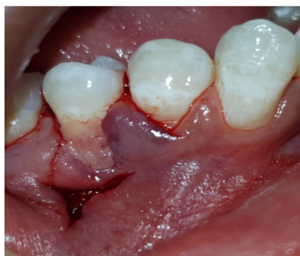
Fig. 10: A-PRF membrane placed