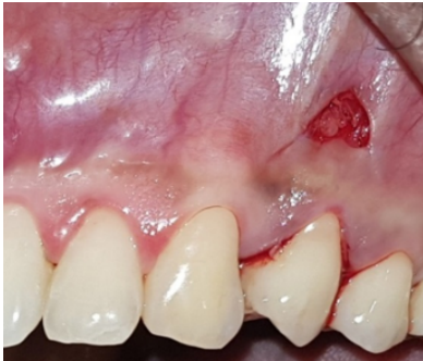
Fig. 2: Incision placed