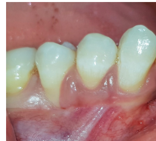
Fig. 7: Pre-operative view

26 year old male patient came with chief complaint of sensitivity in lower right back tooth from past 2 months. No relevant dental and medical history present. On intra-oral examination, gingival recession present in relation to 45 with probing depth of 1mm and CAL of 5 mm.