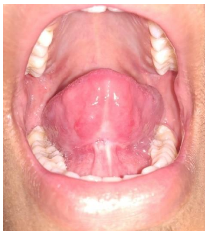
Fig. 3: Healing after 3 month