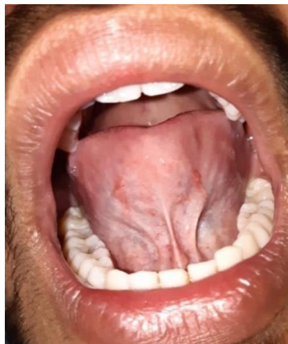
Fig. 1: Pre-operative view of subject with Kotlow Class II ankyloglossia

antimicrobials along with NSAIDS to relief pain for 15 days with instructions to move the tongue slowly to avoid recurrence. The patient was followed up for 5 months with no recurrence and difficulty in phonetics and during intake of food.