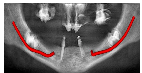
Fig. 4: 3 year post-operative follow-up