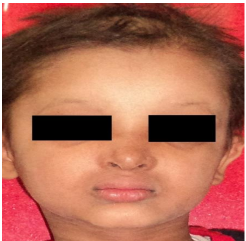
Fig. 1: Three-year old boy with anhidrotic ectodermal dysplasia

resorption of "O" rings as well as head of the ball abutments. So O rings needed to be replaced periodically. Initially, the O rings were replaced every six months along with the changed positions of the metal housings. New holes were made in the denture for attaching the female component for initial 1 year of follow up. Later new set of dentures were fabricated along with new metal housing and "O" rings every year. In this tenure, four new sets of dentures have been given to avoid excessive wear of ball abutment heads caused by increased transverse width of the mandible. Literature reports that implant placement hampers mandibular growth.<sup>12,13</sup> In the above mentioned case report, there was a definite increase in the transverse width of the mandible which needed repeated adjustments in the dentures. But transverse and vertical growth of the mandible was unhampered. Patient got aquainted with dentures at an early age; good compliance was obtained from patient. Excellent oral hygiene was maintained by the patient. Dentures were semifixed so the masticatory efficacy was good. With implant supported overdentures, excellent labial support was obtained. This boosted the self-confidence of the patient. By use of implants, functional needs of the patient could be met because of two stable points ahead of mental foramen. Placement of implants and teeth for function and aesthetics definitely improved the general condition and overall growth of the patient.