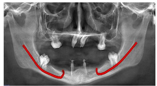
Fig. 5: 6 year post-operative follow-up