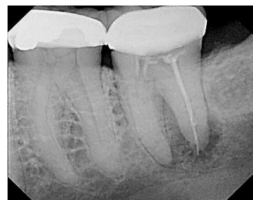
Mandibular second molar showing radiolucency on the periapical region of distal root due to perforation of gutta percha.

Root Perforations: Endodontic failures may also result from root perforations that further lead to periodontal disease by involving the surrounding supporting structures. Teeth that have extensive carious lesions, over obturation or furcation involvement leads to failure of the treatment and development of endodontic lesions. The size, location, time of diagnosis, degree of tissues damaged and ability to prevent or arrest the lesion play a key role in the prognosis of the effected teeth. (21)