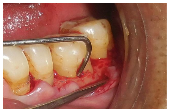
Fig. 3: Furcation defect upon flap reflection

curette, hand and ultrasonic scalers. After this, the defect area was condensed with the bone graft particles (Ostin<sup>TM</sup>, Basic Healthcare Pvt Ltd, Himachal Pradesh, India) mixed with saline and covered by bioabsorbable GTR membrane (Periocol<sup>®</sup>, Eucare Pharmaceuticals Pvt. Ltd., Chennai, India)(Fig. 4 & 5). The membrane being hydrophilic in nature adapted well over the defect and no sututing was required.Flaps were then repositioned and sutured back (Mersilk®, Ethicon, Sommerville, NJ, USA) (Fig. 6). Periodontal dressing was applied over the site (Coe Pak®, GC America, Alsip, IL, USA). Postoperative regimen of amoxicillin 500 mg tds for 5 days, ibuprofen 400 mg tds for 5 days and postoperative instructions were given. Patient was recalled for periodontal dressing and suture removal after 1 week. Post-operative periodontal examination revealed reduction in vertical probing depth (VPD = 3mm) and horizontal furcation depth (HFD =2mm) (Fig. 7) and radiographs revealed increased bone density (Fig. 8), thereby indicating successful resolution of inflammation and periodontal regeneration in the furcation defect area.