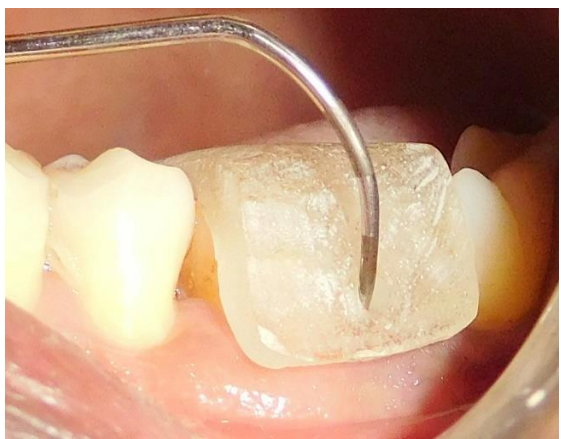
Fig. 7: Six-month horizontal furcation depth