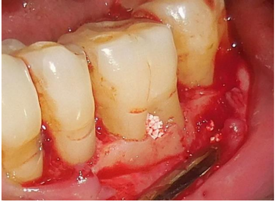
Fig. 4: Furcation defect with alloplastic bone graft