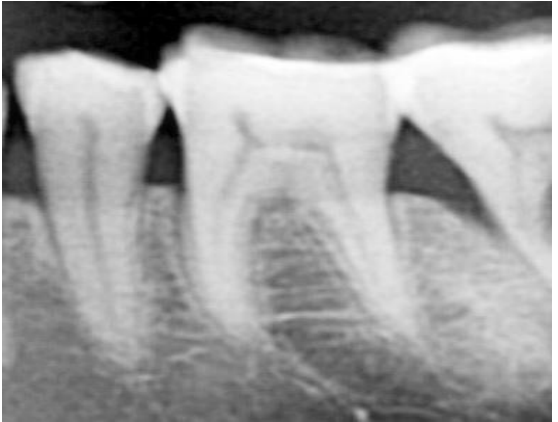
Fig. 8: Six-month postoperative RVG