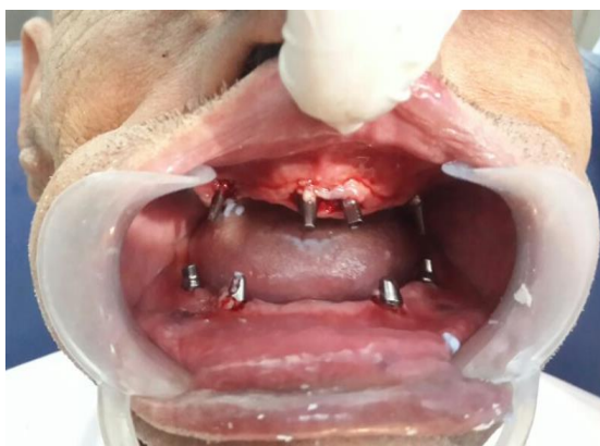
Fig. 3: After immediate placement of Abutments

Local anesthesia was administered by both block and infiltration technique. Implant placement Touareg S (Adin) implants were inserted. Subject received 2 distally tilted implants in the posterior region followed by 2 anterior implants in the mandible. In the maxilla, the tilted implants were positioned just anterior to the maxillary sinus. The drill protocol followed the manufacturer's guidelines. The implant sites were usually underprepared avoiding countersinking to engage as maximum cortical support bone as possible. The recommended drill sequences for soft bone type IV, medium type II and type III, and dense type I bone were followed. A manual surgical torque wrench (Adin) was used to check the final torque of the implant. In this case of immediate implant placement, the soft tissues were readapted to obtain a primary closure around the abutments and fresh extraction sites and then sutured back into position with interrupted resorbable 4.0 vicryl (Ethicon). Straight, multiunit abutment, internal (Adin) were used to achieve relative parallelism of the implants so that a rigid prosthesis would seat in a passive manner.