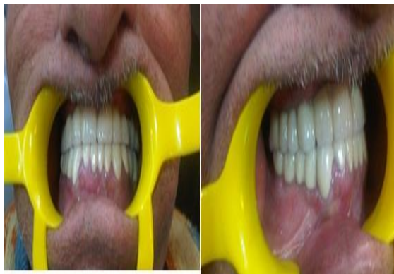
Fig. 5: After placement of complete prostheses