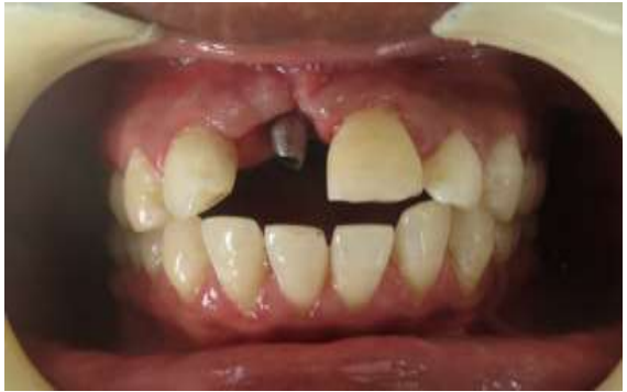
Fig. 11: Abutment placed