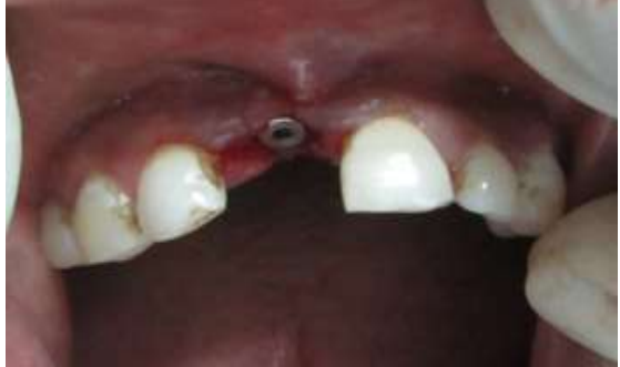
Fig. 10: Gingival former placed