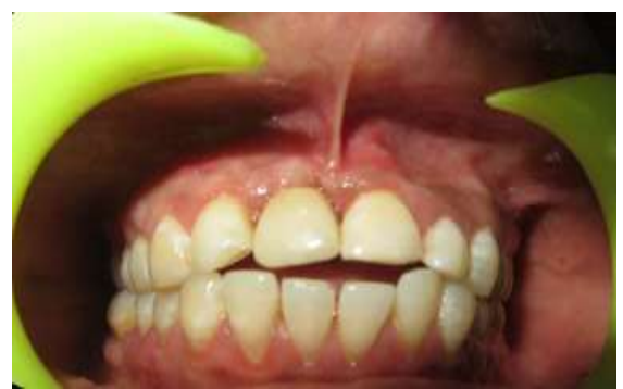
Fig. 12: Prosthesis delivered but still abnormal frenal pull present