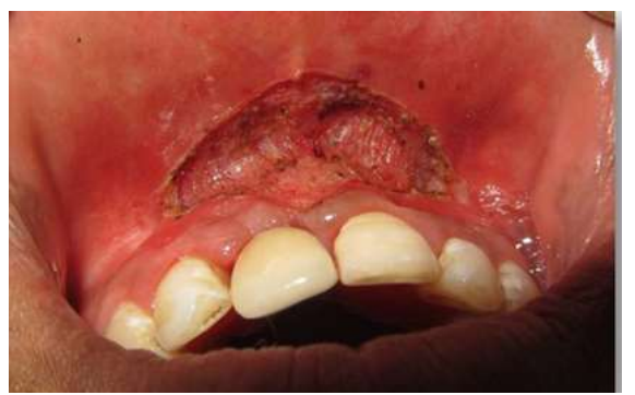
Fig. 14: Frenectomy done