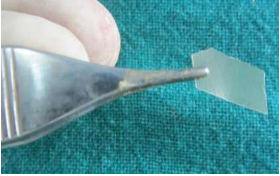
Fig. 8: Collagen membrane