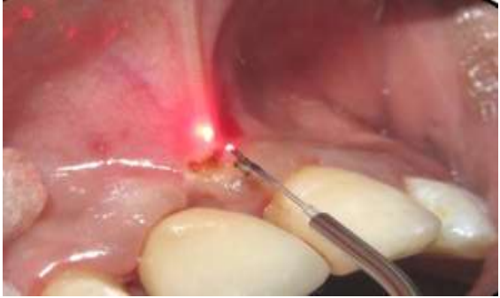
Fig. 13: Frenectomy done by laser