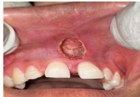
Figure 8: Immediate post operative