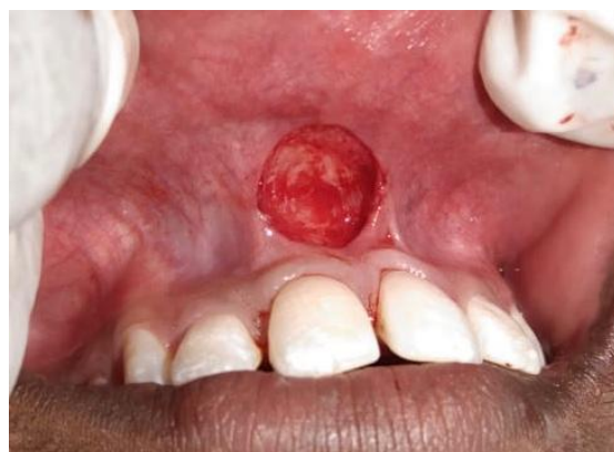
Figure 2: Intra operative