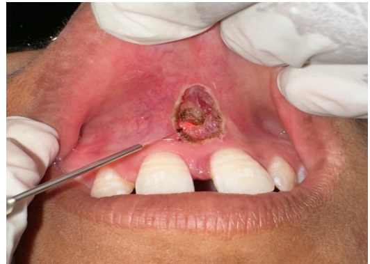
Figure 7: Intra operative

For the laser group, diode laser with 808nm wavelength was used. A 400- \mu m fiber tip was used at power setting of 1.5 W in contact mode and moved with a paint brush stroke, from the base to the apex of the frenum, thereby excising it. Sutures were not used in this group. Similar postoperative instructions were delivered to the patients of both the groups. The use of analgesic containing Ibuprofen 400 mg + paracetamol was left to the patient's discretion and to be taken as and when needed. Each of the patients was recalled 3 months after the surgery to determine the healing outcome.