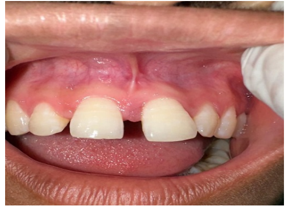
Figure 6: Pre operative