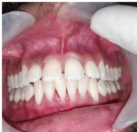
Figure 1: Pre operative

After thorough clinical and hematological examinations, a frenectomy was performed using the conventional approach. A hemostat was used to grasp the frenum and was inserted into the depth of the vestibule. Incisions were then made on both the upper and lower surfaces of the hemostat. A blunt dissection was carried out down to the bone to release the fibrous attachment. The edges of diamond-shaped wound were sutured with interrupted sutures (nonresorbable 3-0 braided silk). The area was covered with a periodontal pack. After surgery, the patients were advised to take soft foods for 1 week. Post 1 week, sutures and Coe-pak were removed. Tablet Ibuprofen 400 mg + paracetamol TID and tablet amoxicillin 500 mg (Novamox, Cipla Limited, India) TID for 5 days were prescribed.