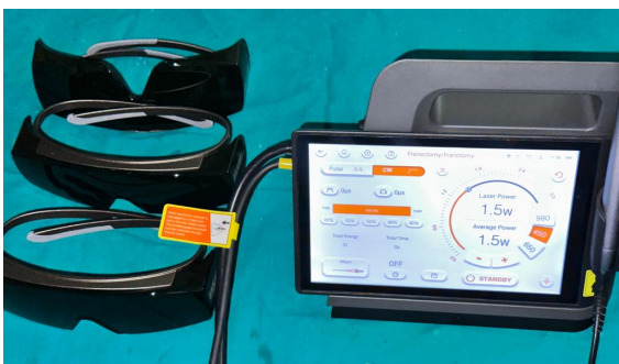
Figure 5: Diode laser