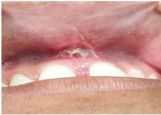
Figure 9: 7 day post operative