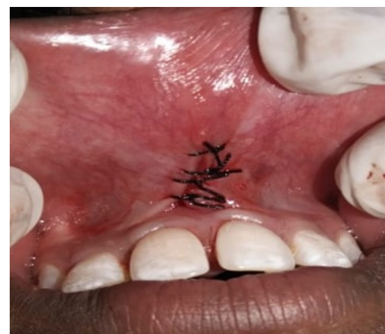
Figure 3: Immediate post operative