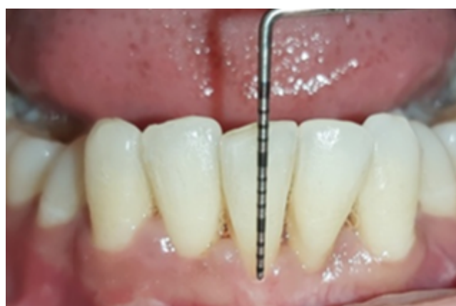
Fig. 1: ClassII Recession irt 31,41