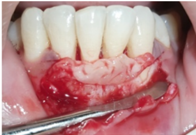
Fig. 6: PRF membrane