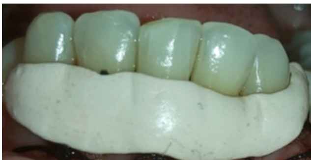
Fig. 7: Periodontaldressing placed after suturing