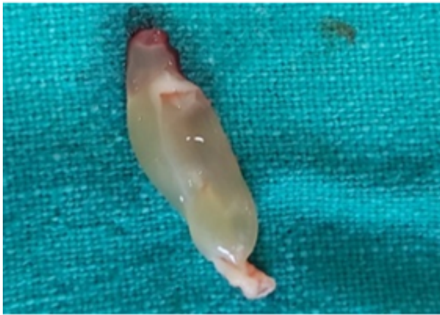
Fig. 5: Placement of PRF