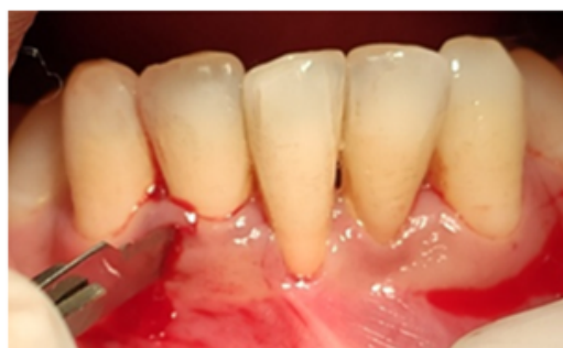
Fig. 3: Incision