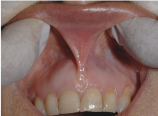
Fig. 1: Blanching/Tension test

The abnormal frena can be diagnosed visually by moving the upper lip outwards and downwards and lower lip is moved outwards and upwards. If the gingival margin shows movement or if blanching is seen due to ischemia, then the test is positive and the frenum is said to be aberrant. This test is known as the Blanching test or Tension test. (Figure 1)