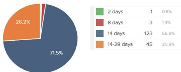
Fig. 1: Incubation period of COVID-19

Regarding attitude more than half (59.7%) participants ponder that electronic media is an efficient medium for enhancement of oral hygiene education, whereas 61.1% consider telephonic or video conferencing visits are efficient to deal with non-emergency patients. However, nearly two-third of the contestants is of the opinion that more training is required for handling electronic media for academic purpose. More than 70% of participants agree that training of faculty and staff in infection control, with sufficient protective equipment be effective in protection against transmission of disease.[Table 3] Most of the participants have expressed that this pandemic outbreak of COVID-19 has been a stressful period for them whereas a few had different opinion. [Figure 3]