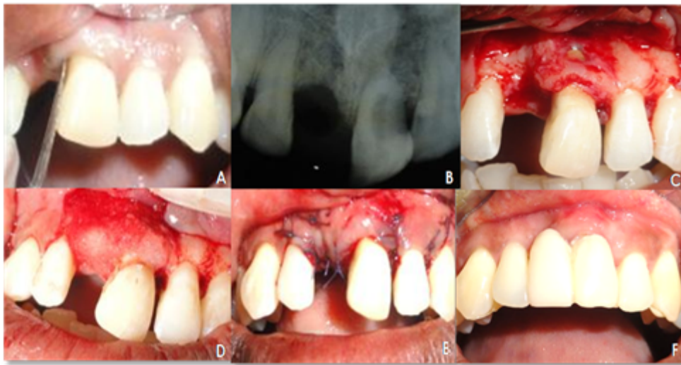
Fig. 4: Case 4

The first two cases presented fell into the category of Primary periodontal lesion with secondary endodontic involvement. And the next two were the cases where the traumatic occlusion was the causative factor. Ideally the treatment plan in the last two cases should have included an orthodontic correction but as the patient was not willing to go for the orthodontic treatment and the prognosis for the same was questionable, we went ahead with an endodontic treatment followed by periodontal treatment.