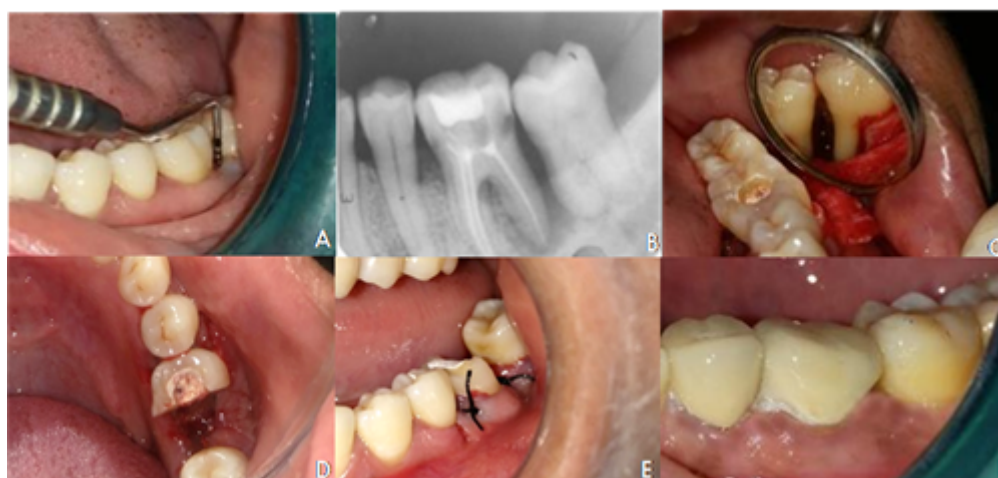
Fig. 2: Case 2

local anaesthesia. Crevicular incision were given and full thickness mucoperiosteal flap was reflected. Fenestration was noted at root apex and alveolar ridge defect in 11 region. Gutta percha was burnished at root apex and the fenestration area was closed using a GTR membrane. The alveolar defect was restored with Perioglas bone graft followed by placement of Perio Col GTR. Flap was sutured and periodontal dressing was given.